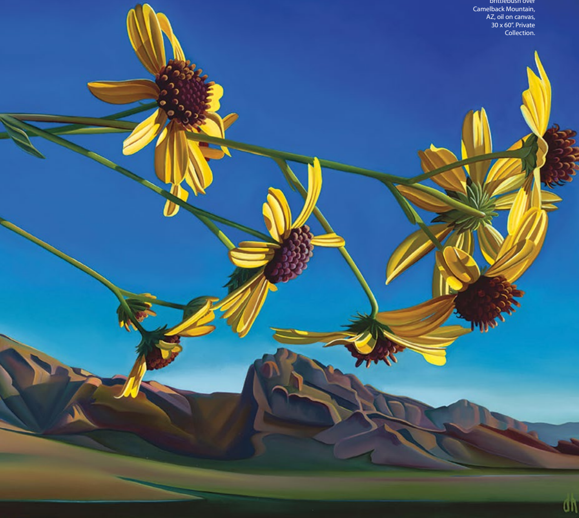
I'll Be Back, brittlebush over Camelback Mountain, AZ, oil on canvas, 30 x 60". Private Collection.

A rizona, with its extreme variations in elevation and climate, is home to almost 4,000 species of native plants, making it one of the most floristically rich regions in the United States. This abundance also makes it a perfect home for artist Dyana Hesson, whose focus is painting the state's vast botanical biodiversity ahead of a sweeping showcase of her progress at Tucson's Arizona-Sonora Desert Museum in the fall of 2025.