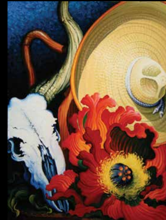
Adormidera — California Before Oil | 40 x 30 inches | 1998