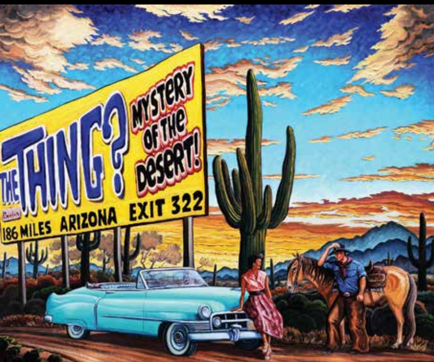
The Thing Oil | 24 x 30 inches | 2024