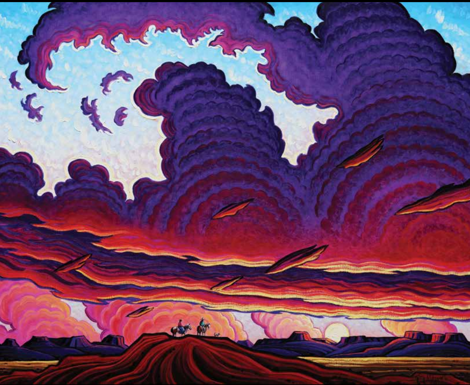
Navajo Dawn Oil | 24 x 30 inches | 2024