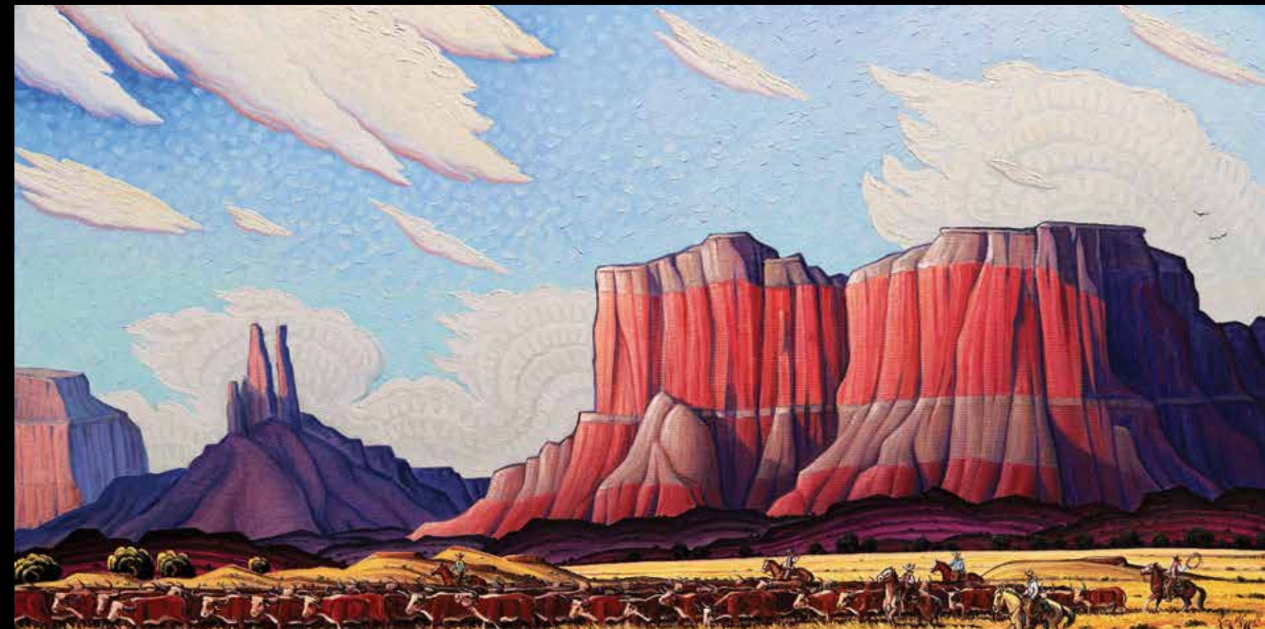
End of the Day Oil | 24 x 48 inches | 2024

So, Wiggins set to work in his studio, creating a painting for the exhibition in the unmistakable style he had thoughtfully developed during his career: Modernist in inspiration, with exaggerated forms, dramatic light, symbolism, and high-key, vibrant colors that seemed to radiate from the canvas and illuminate the room. The resulting painting, Adormidera — California Before , depicts through symbolism the Hispanic influence on early California.