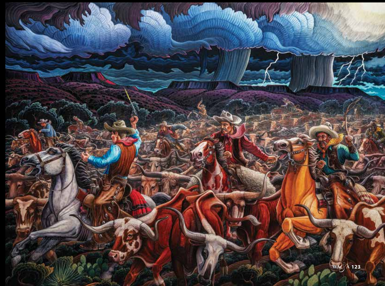
Revolution Oil on Birch Panel | 60 x 60 inches