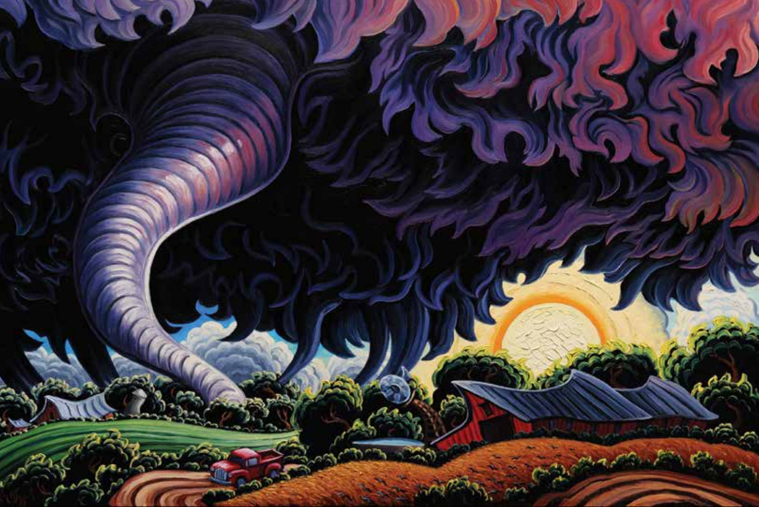
Along Tornado Alley Oil | 24 x 36 inches | 2024