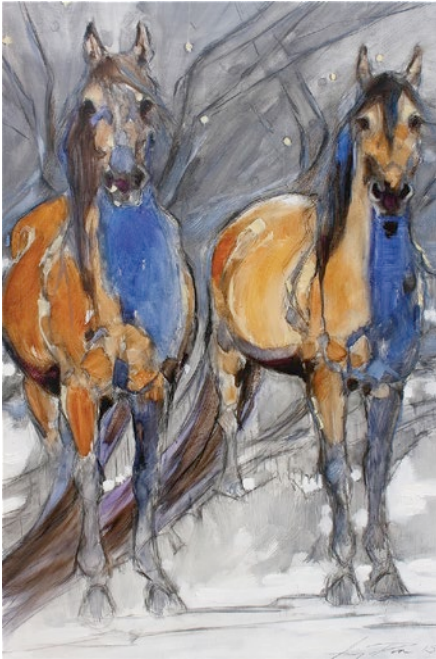
Amy Lay, Pegasus , oil, 36 x 24"