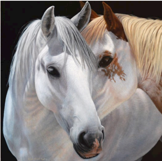
Gail Gash Taylor, Heaven is For Horses , oil on panel, 24 x 24"

60-inch-wide winter scene in a calm pasture with several horses.