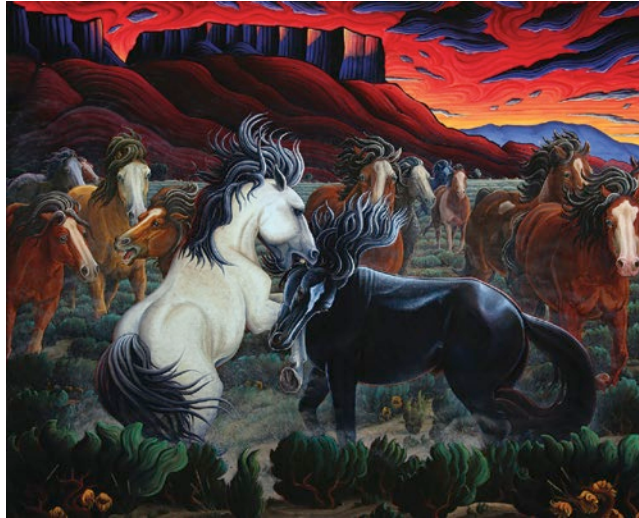
Kim Wiggins, A Vanishing Breed , oil, 40 x 50"