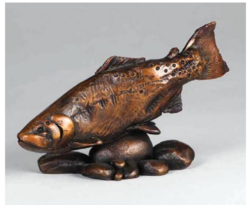
Paul Rhymer, Trout , bronze, 5 x 4"