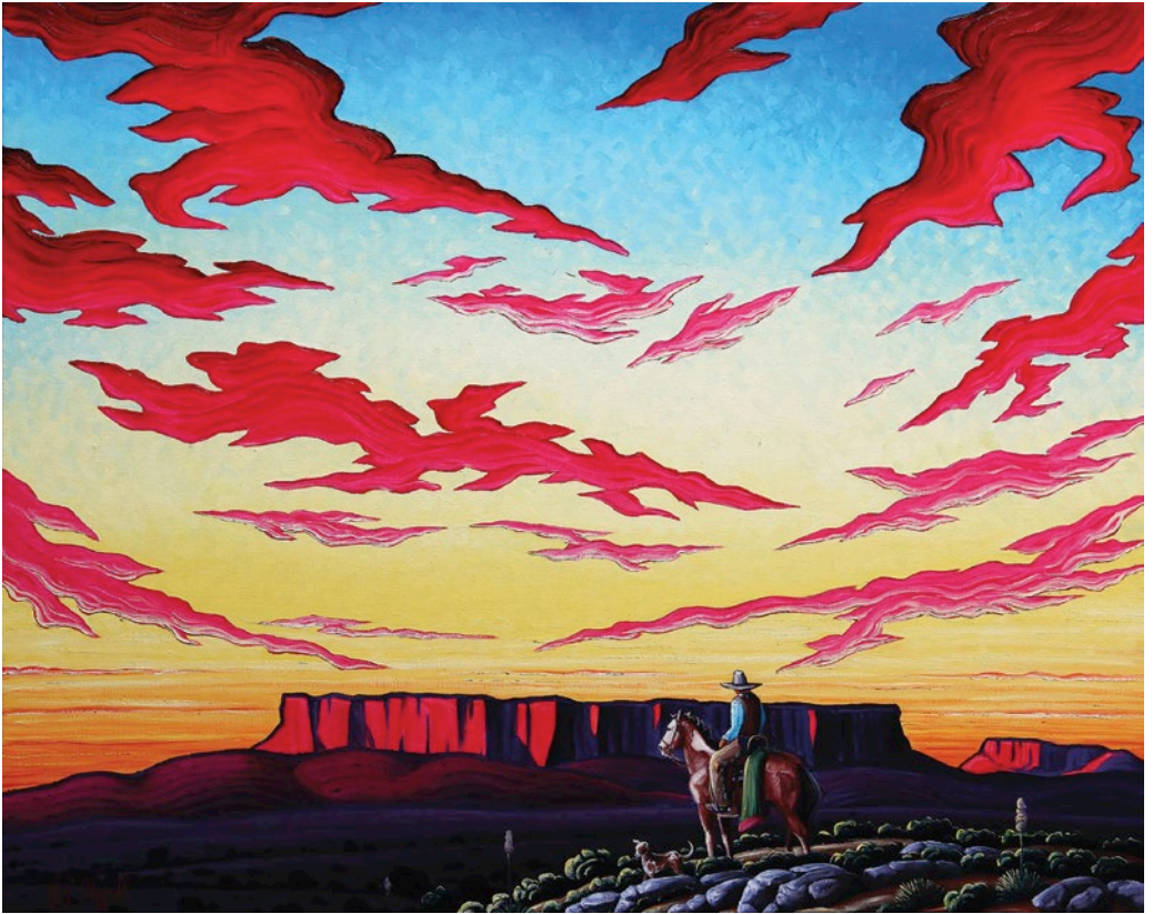
Kim Wiggins, Twilight Along the Pinta , oil, 9 x 12"