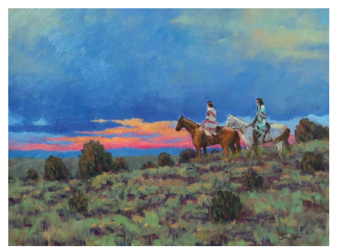
Don Brackett, Spirits in the Wind, oil on canvas, 30 x 40"