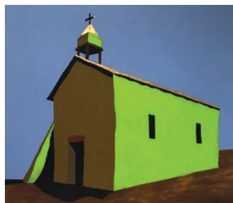
Canoncito , gold leaf and acrylic on panel, 48 x 48"