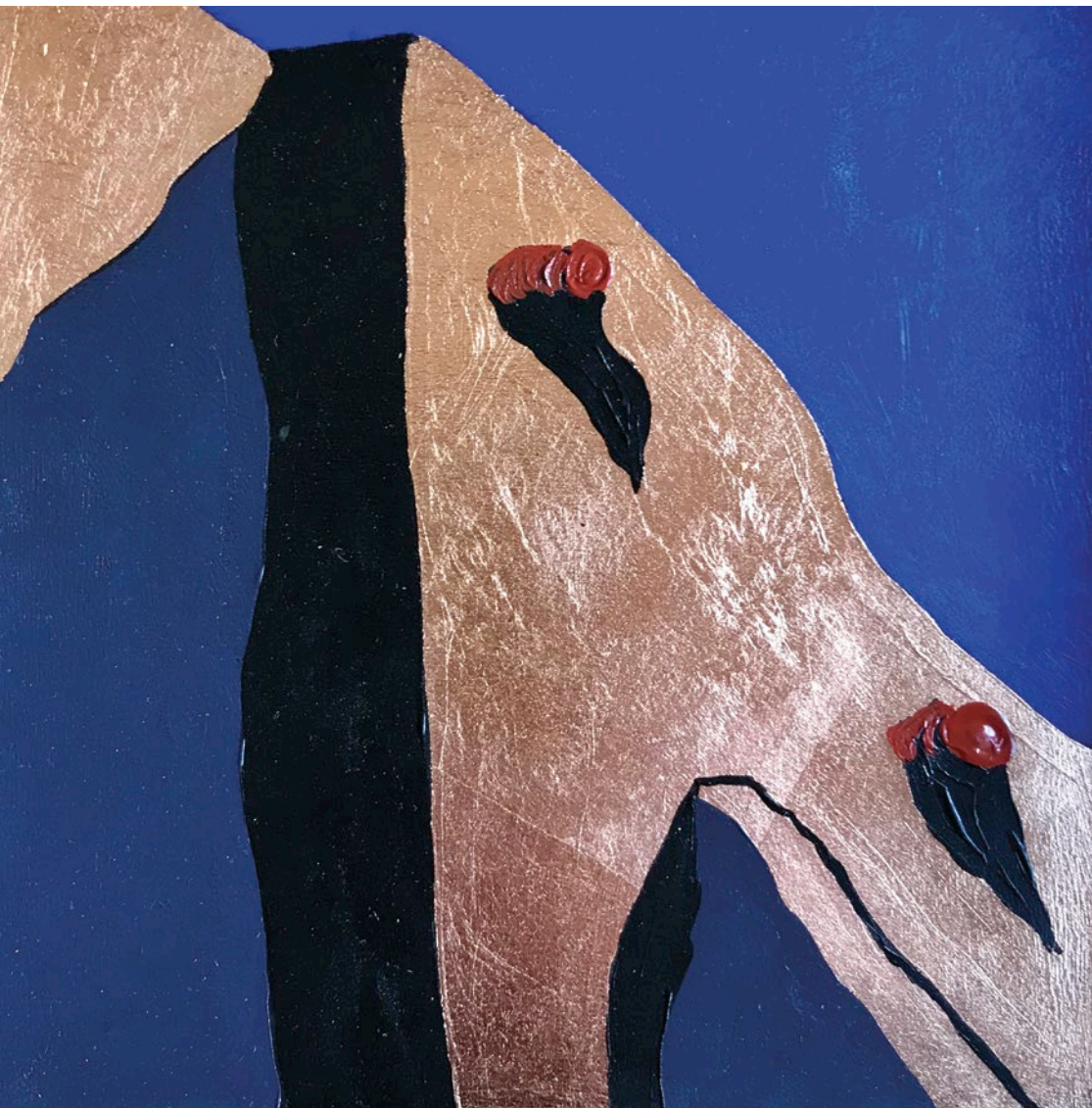
Santa Fe Skies , copper leaf and acrylic on panel, 30 x 40"

super warm, bright light...the high contrast of the brights and the darks," he says. This is evident in works like Santa Fe Skies , copper leaf and acrylic on panel. "I chose to use copper because I feel like it really emulates the feeling of light," he says.