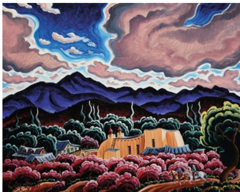
A Ride in Spring , oil, 11 x 14"

Yet it is his New Mexico landscapes that are, perhaps, best known.