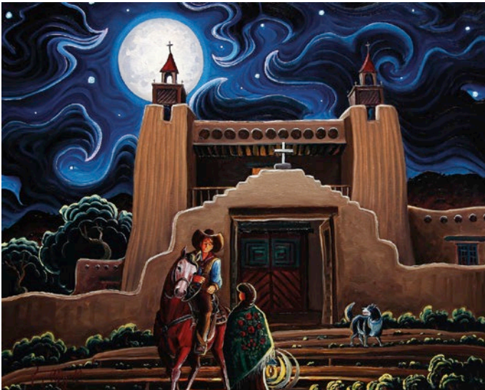
Lovers at Las Trampas , oil, 16 x 20"

In Pecos Valley Sunset a farmer plows his field on his green John Deere, dwarfed by the mountains and the landscape around him. Fields, trees, windmills and farm buildings morph into one energetic whole formed on canvas by his thick impastos of paint and echoing the oneness of nature.