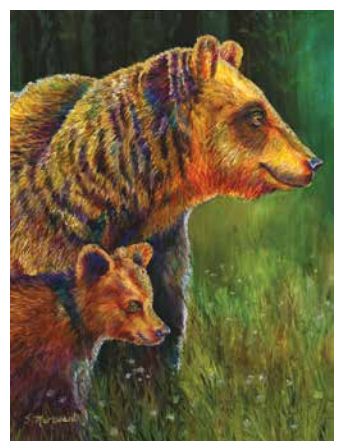
Mother's Day, oil with gold and silver leaf on canvas, 40 \times 30 "