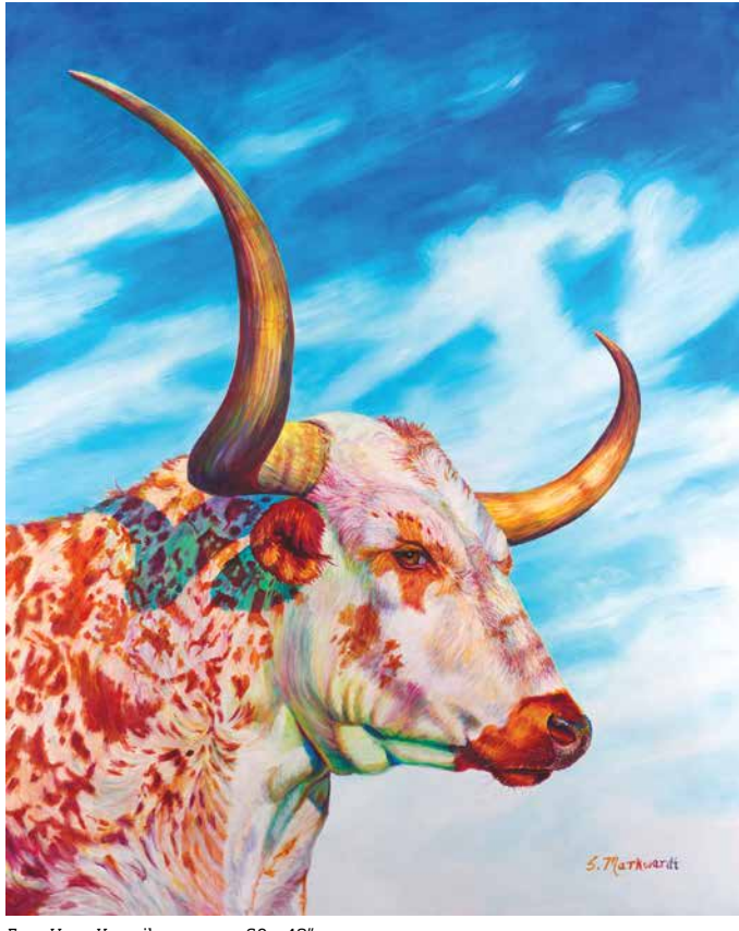
Eyes Upon You, oil on canvas, 60 x 48"