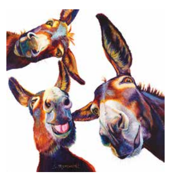
Wise Asses, oil on canvas, 48 x 48"