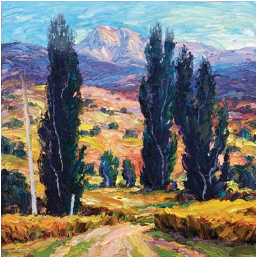
Brad Teare, Autumn Colors , oil, 20 x 20"