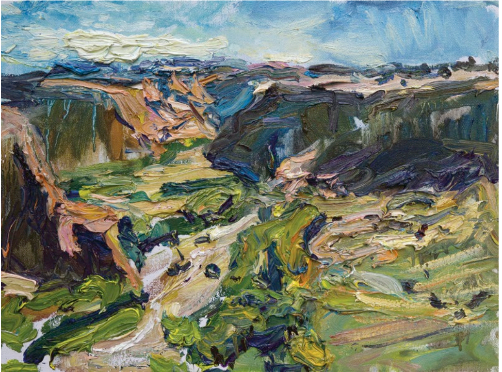
Ulrich Gleiter, Canyon , oil, 12 x 16"